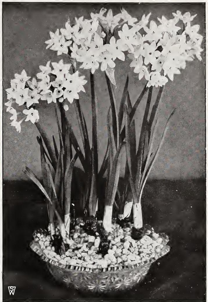
Paper-White Grandiflora Narcissi growing among pebbles in water

PEBBLES. Carefully screened and selected. Quart box 20 cts., 2 qts. for 35 cts.